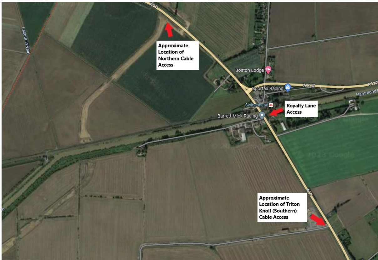
Plate 6.1 – Proposed Off-Site Cable Corridor Access Locations